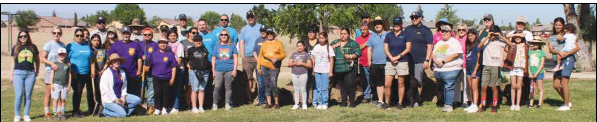
Trees were planted at Shafter's parks to improve the air quality.