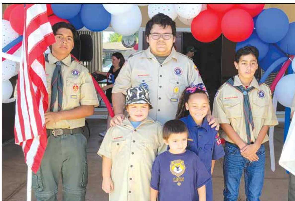
The Boy Scouts will lead a flag ceremony to salute the flag's presence as a sign of respect to our nation and those within it.