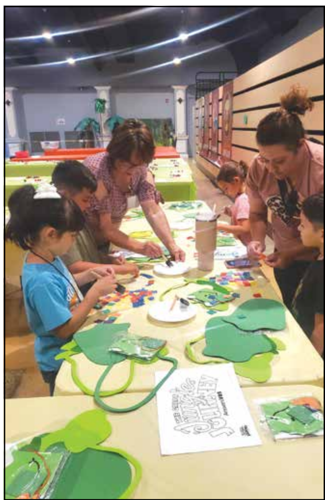
Music was a big draw for the event. MIDDLE: There was choreography to the music as well. RIGHT: Arts and crafts were a part of the VBS.