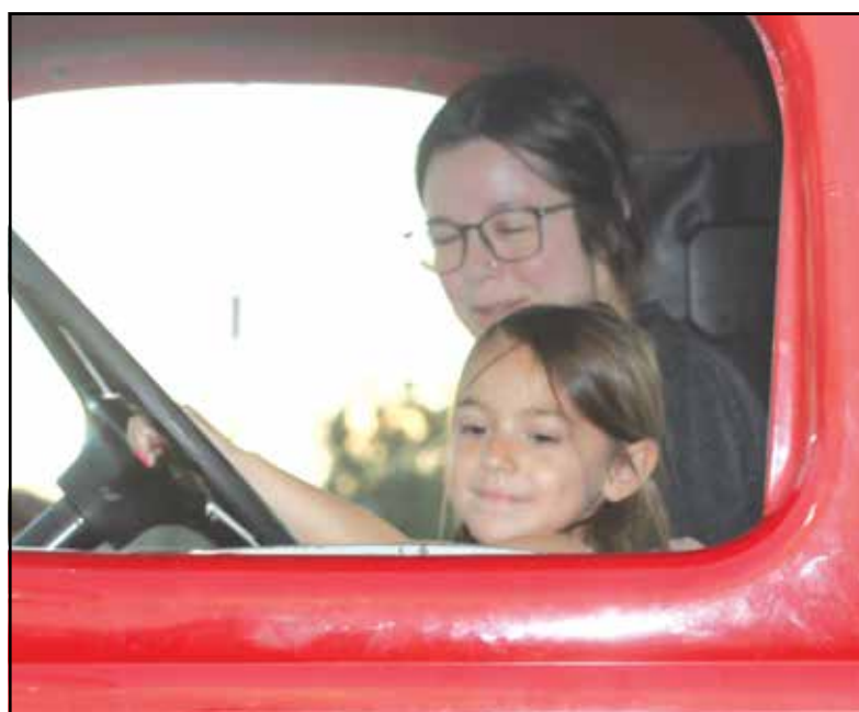
There will be plenty to do for the kids, including getting to sit in a military-style vehicle from Minter Field Air Museum.