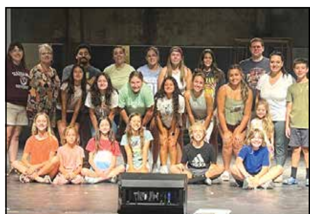
Part of the Matilda cast.