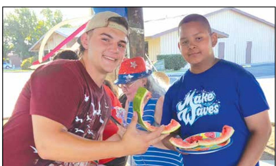
Participants at last year's event compete for a chance to be crowned the Watermelon Eating Champion of the festival.

City of Wasco Animal Control will hold a free adoption event at Barker Park from 10 a.m. to 2 p.m. on the same day.