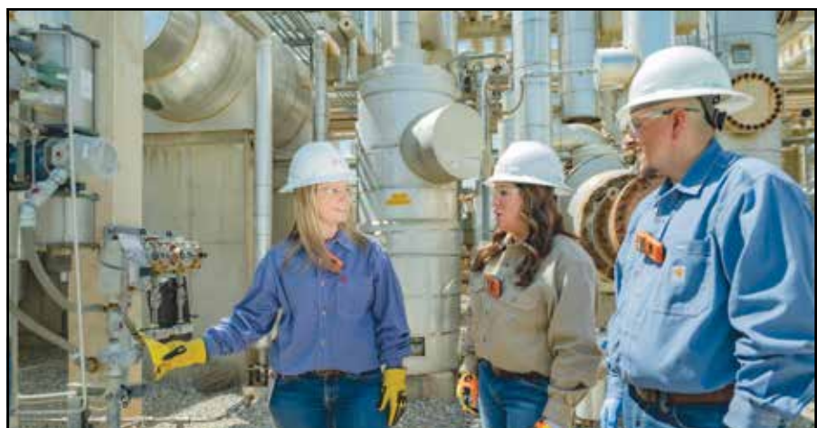
Aera volunteers at a coat drive in Wasco in partnership with CAPK in November. RIGHT: Aera Energy employees performing an inspection at a field location.