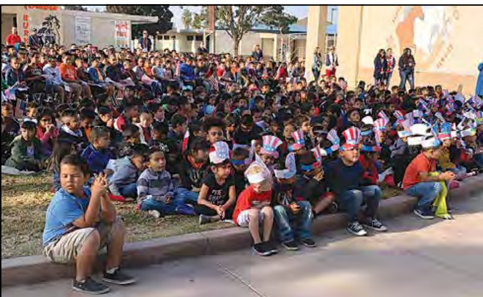
Students sat quietly on the lawn.