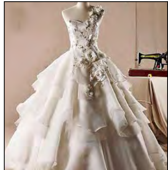
Another wedding dress used to advertise the store.

Quinceañera dress prices range from $299 up to $1,000, while wedding dresses go as high as $1,200.