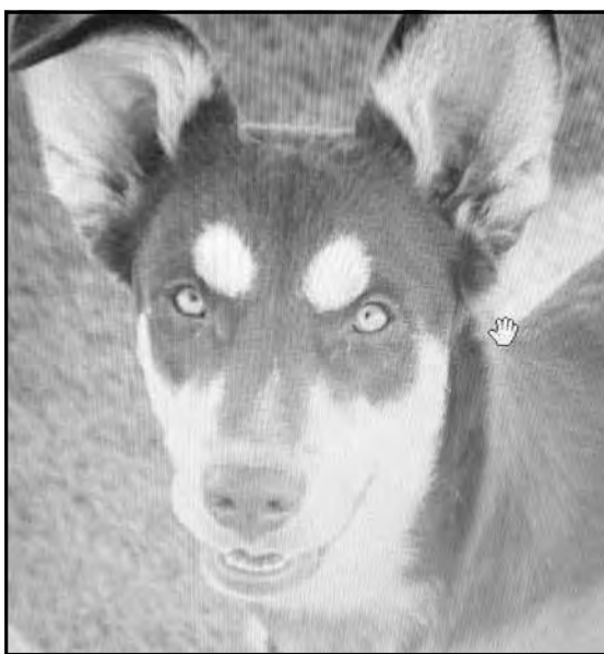
Alice is great with people.