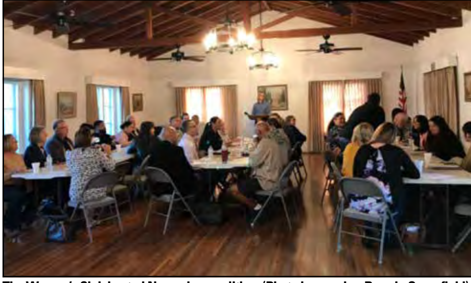
The Woman's Club hosted November coalition.