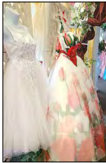
Full-length evening and bridal dresses are sold in the shop.

In addition, once the customer has purchased the dress, Casillas offers alterations.