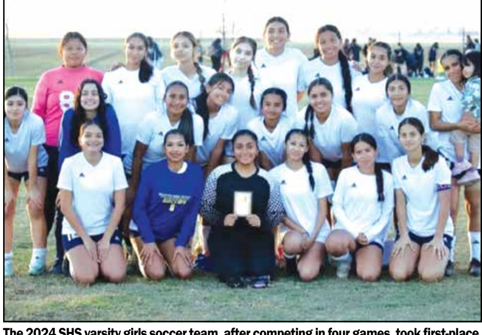
The 2024 SHS varsity girls soccer team, after competing in four games, took first-place.