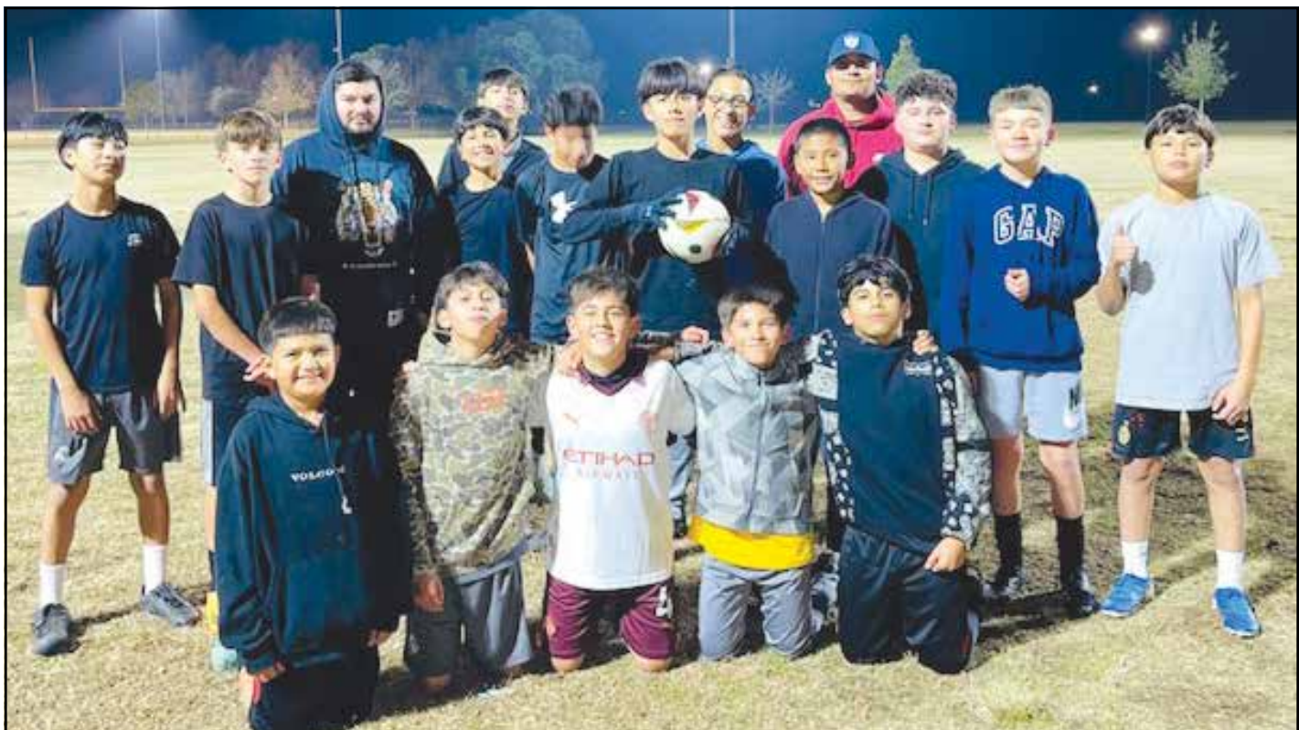
Players celebrate the addition of bright lights to the soccer fields, allowing them to practice well into the evening hours.