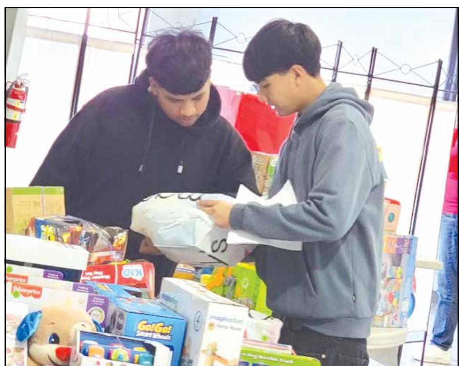
Wasco FFA Club shoppers carefully hand-select a special age-appropriate toy for each child they shop for.