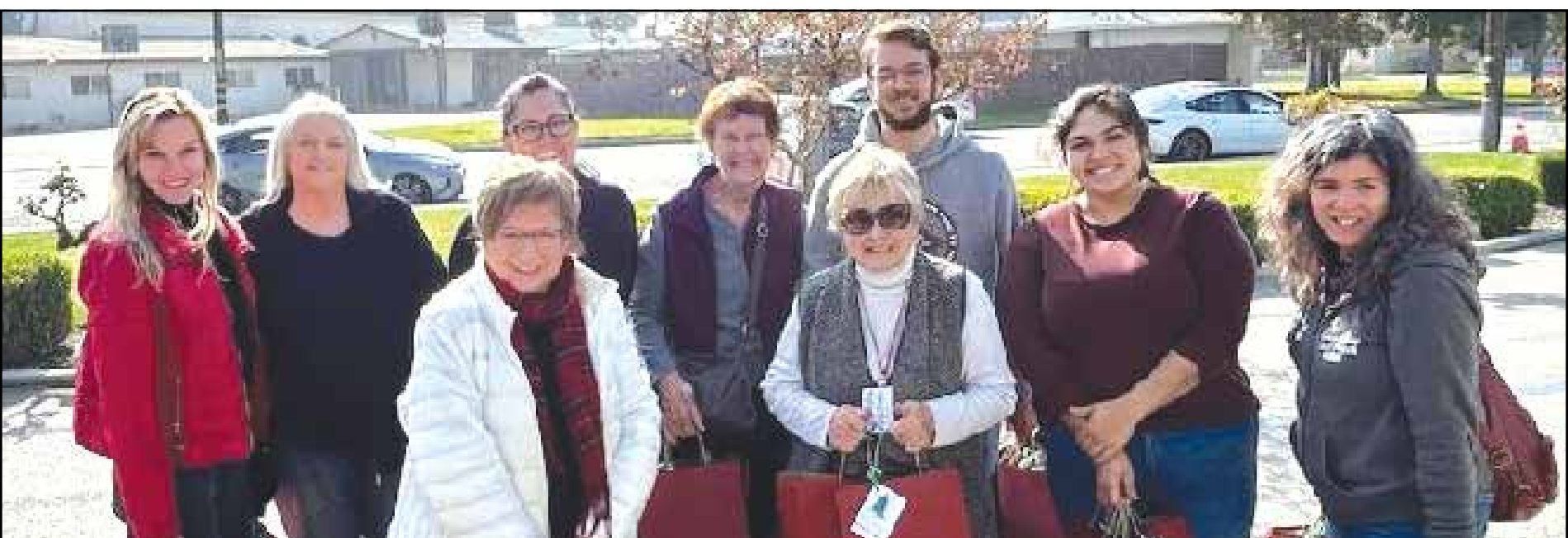
Shafter Woman's Club members and Carrington friends after a day of distributing gift bags and singing Christmas carols with the seniors.