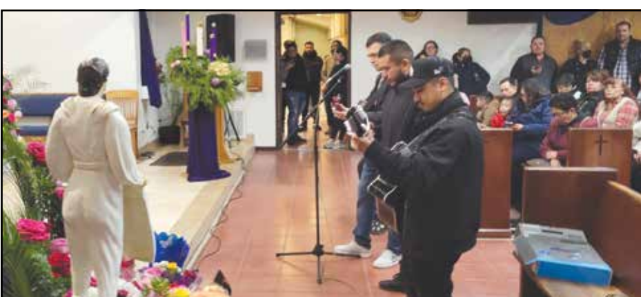
Los Amigos del Inicio, a band from Shafter, fills the church with Latin American melodies during the Feast of Our Lady of Guadalupe.