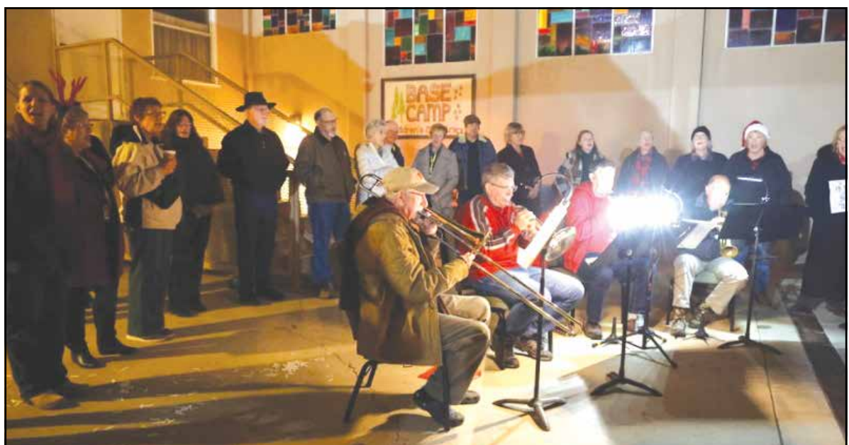
A local brass group entertained the crowd with holiday music.