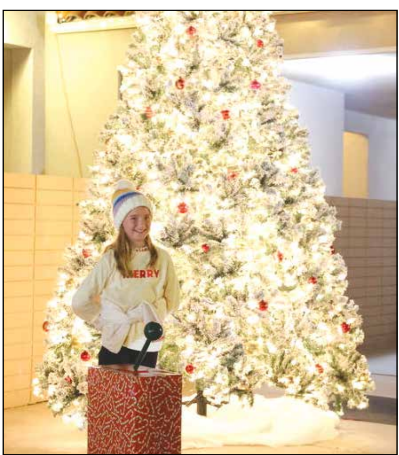
The Christmas tree lighting was one of the event's highlights.