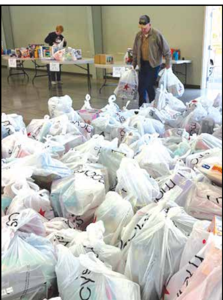
Bags of toys from Macy's, ready to be sorted by age and gender.

Rose Queen and her court, and all the individuals who donated to us throughout the year."