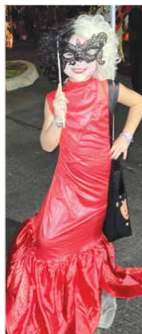
A trick-or-treater dressed as Cruella de Vil from the "101 Dalmatians" cartoon at the 2023 event.