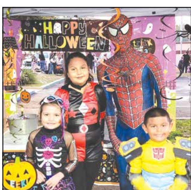
Children in their Halloween costumes pose with Spider-Man at last year's Trunk or Treat.