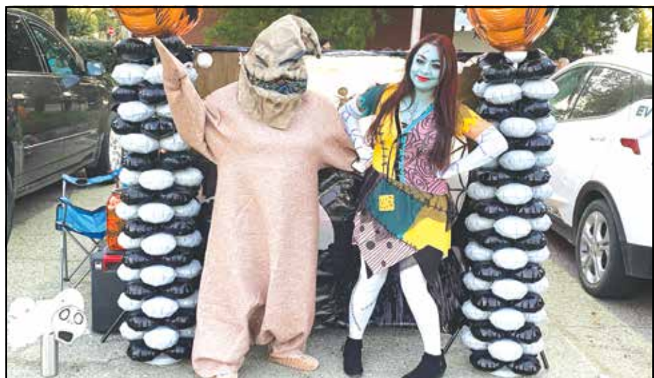
Community members celebrated with festive costumes and creative trunks filled with candy at the 2023 Shafter Lions Club Trunk or Treat event.