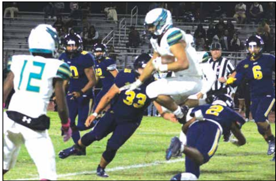
The Generals' defense upend the Thunderbirds.