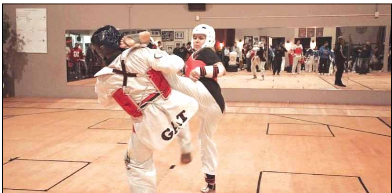
The team competes in several tournaments throughout the year.

Hearing impaired individuals may use the California Relay Service at 711 or 800-735-2929 TTY/VOICEMAIL to voice. Additional information on DTSC sites can be found through our EnviroStar.