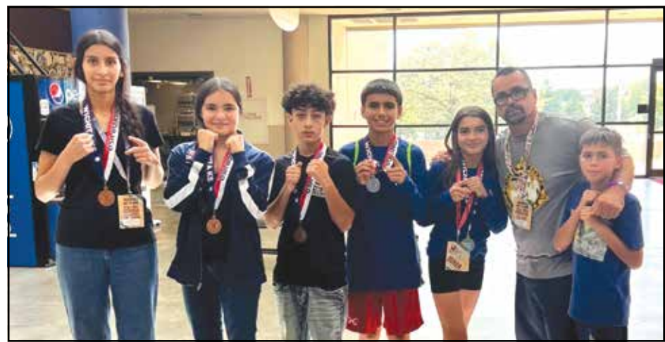
The Shafter Boxing Club came home with five medals.

This group is just the latest in a series of champions that have come out of the Shafter Boxing Club. While clubs three times their size are fighting for a medal or two at competitions, the Shafter club has been turning