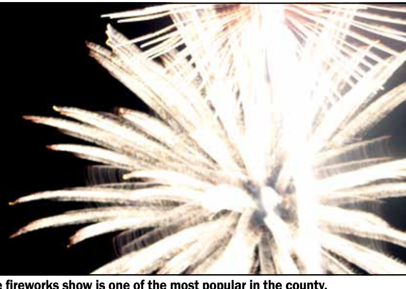
The slides were a big hit. RIGHT: The fireworks show is one of the most popular in the county.