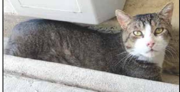
Newbie is available at the Shafter Animal Shelter