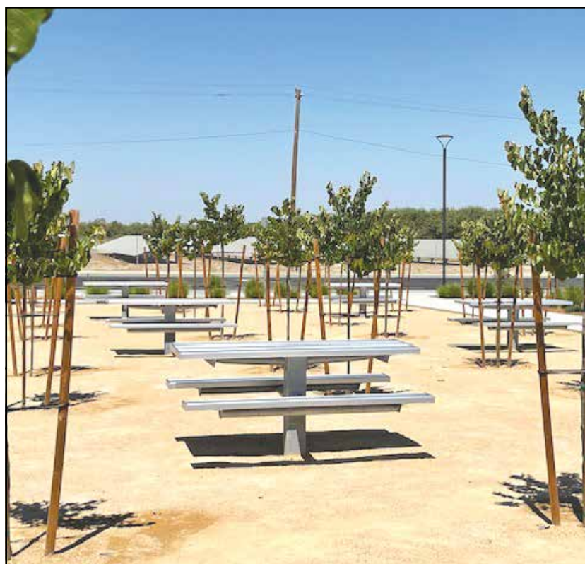
Central Avenue Park A perfect spot to relax and enjoy the park's amenities.

A public ribbon-cutting for Central Avenue Park is set for Friday, July 19, from 9 to 11:30 a.m. This new park is the result of years of planning and months of construction. Many organizations and individuals contributed to the project, and this celebration allows recognition of all the hard work. The park provides a new recreation facility for the southwest part of town and connects the existing walking paths on Central Avenue and Filburn Avenue. The park's numerous trees and other plant varieties will mature and will provide shade in the coming seasons. The ball court is already popular, and the picnic area is being used by families. The park also includes separate play areas for youngsters, older children and adults.