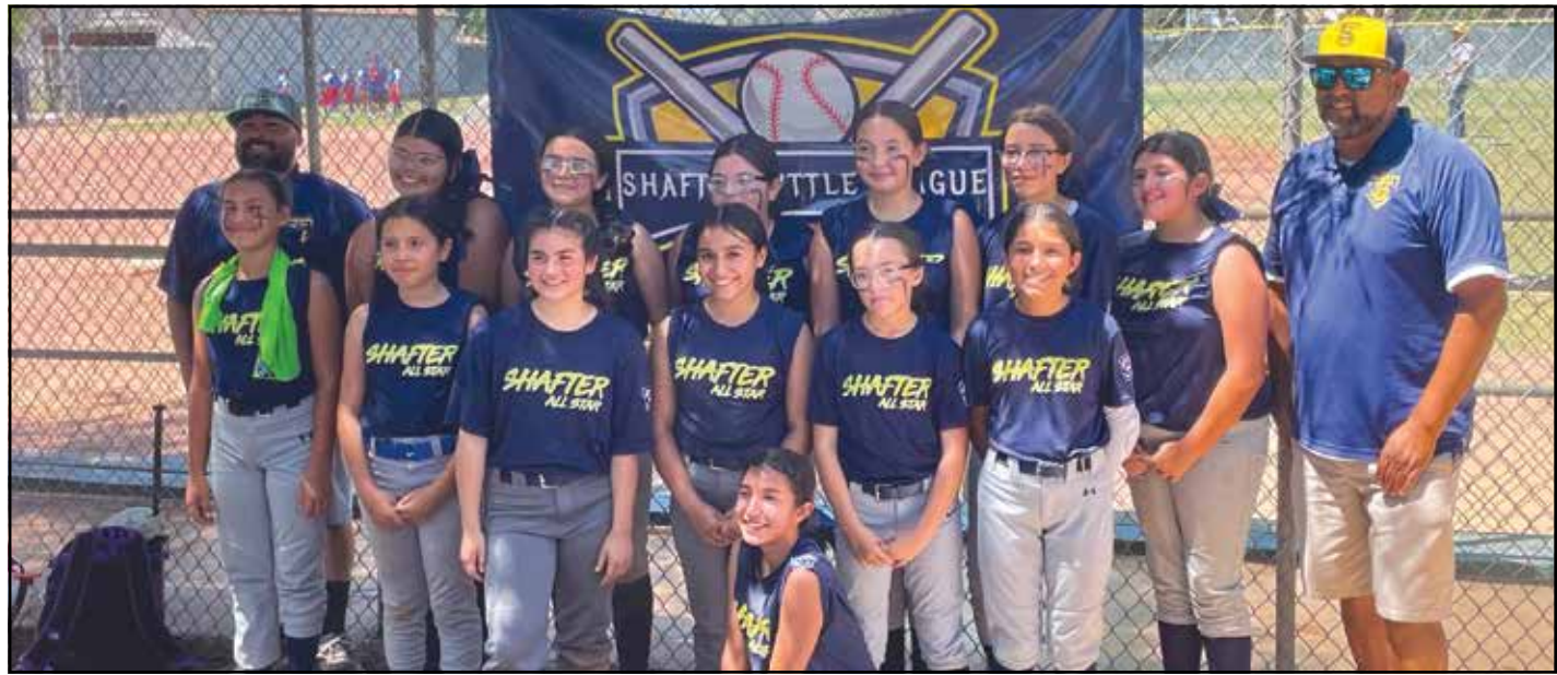
Shafter Little League Softball Champions ended up third in the Section.

The boys team will travel to Madera on Friday, playing against Chowchilla. The winner of the Sectional playoffs will advance to the State Tournament, which will be held in San Bernardino. For all of the