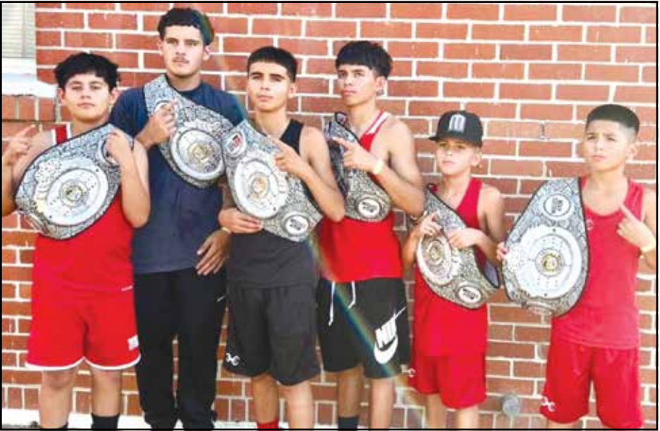
Six belt winners from the Shafter Boxing Club.

The Shafter Boxing Club, along with the Shafter Lions Club, held their annual USA Boxing event in Shafter at the Shafter Veterans Hall on Saturday, putting on a total of 30 bouts. The boxers ranged in age from 8 to 30 years old.