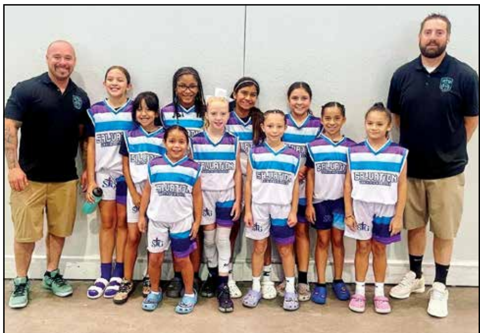
The Girls 10U team had an outstanding season.

mission and the reason that it was born in the first place. "Our goal is to produce elite athletes and good kids who want to excel in whatever they pursue in life."