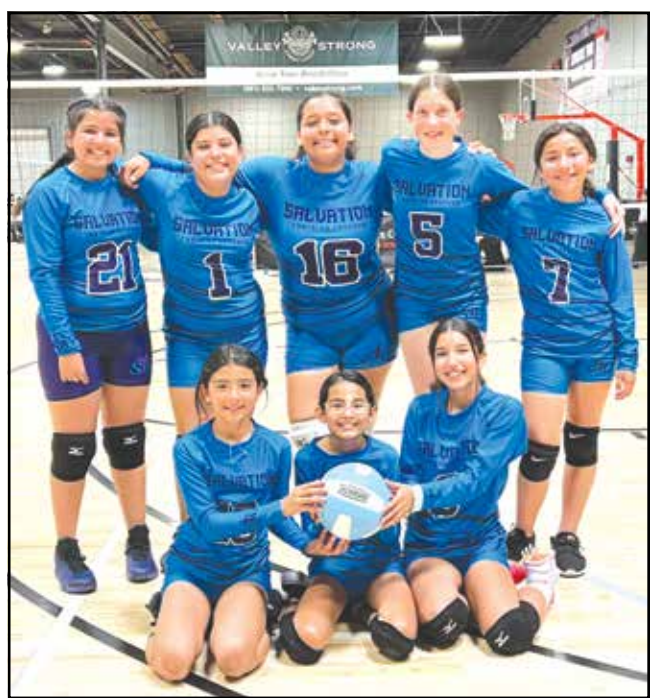
The Boys 10U basketball team. RIGHT: Volleyball teams were added this year.