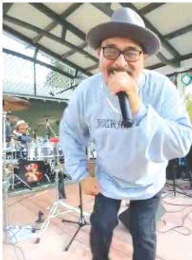
Rockamole provided the entertainment.

The Shafter Recreation Department provided activities for the kids to do, and one of the main objectives of this month's event was to give a head start to the Shafter Lions Club Stuff the Bus event that