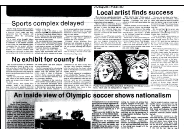
The front page, Aug. 15, 1984.