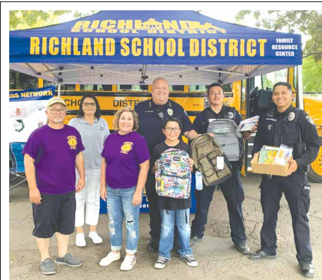
The Shafter Police Department and Shafter Lions Club had their bus at the event.